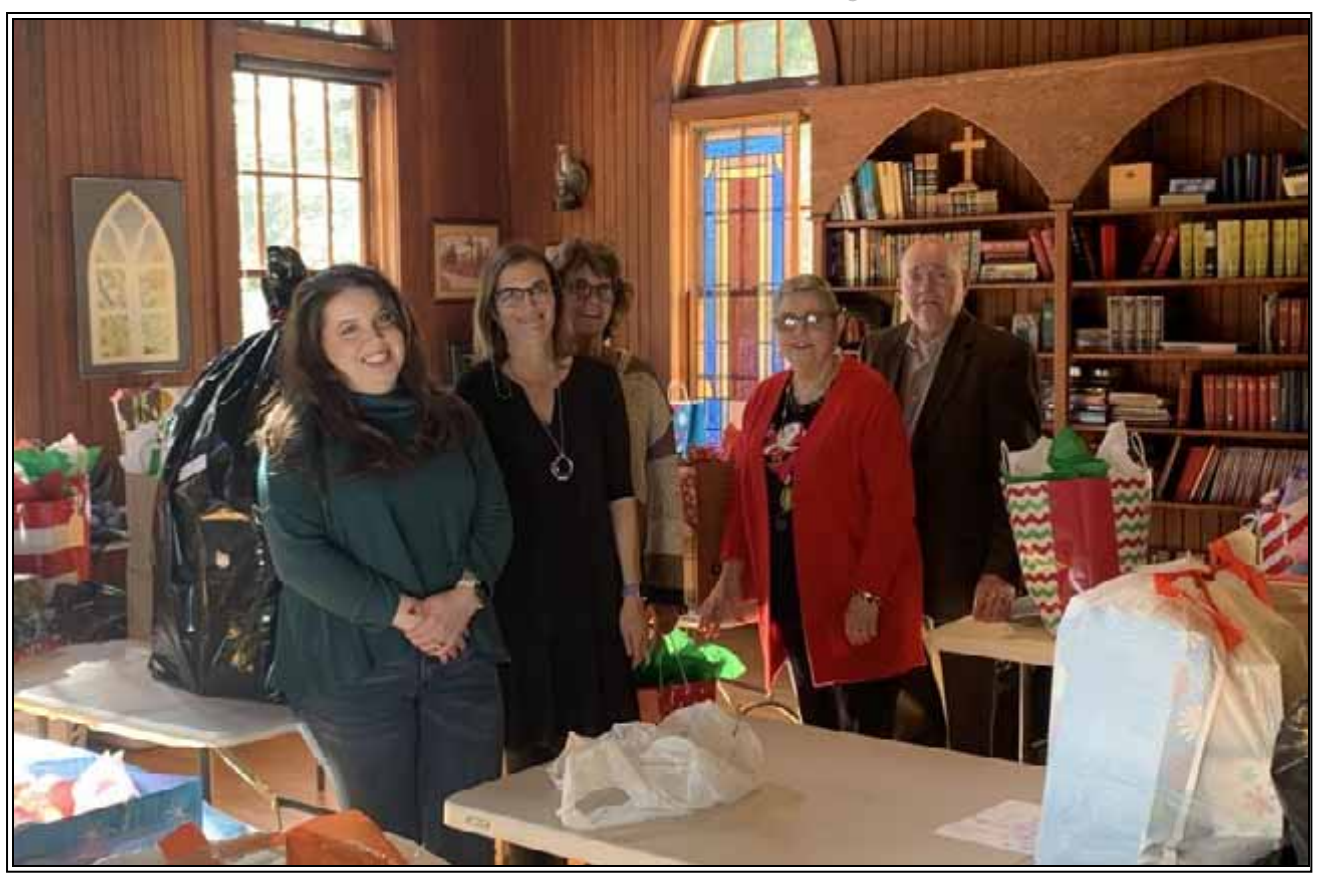
Church members donated clothes and toys for the children at Lifting Lives