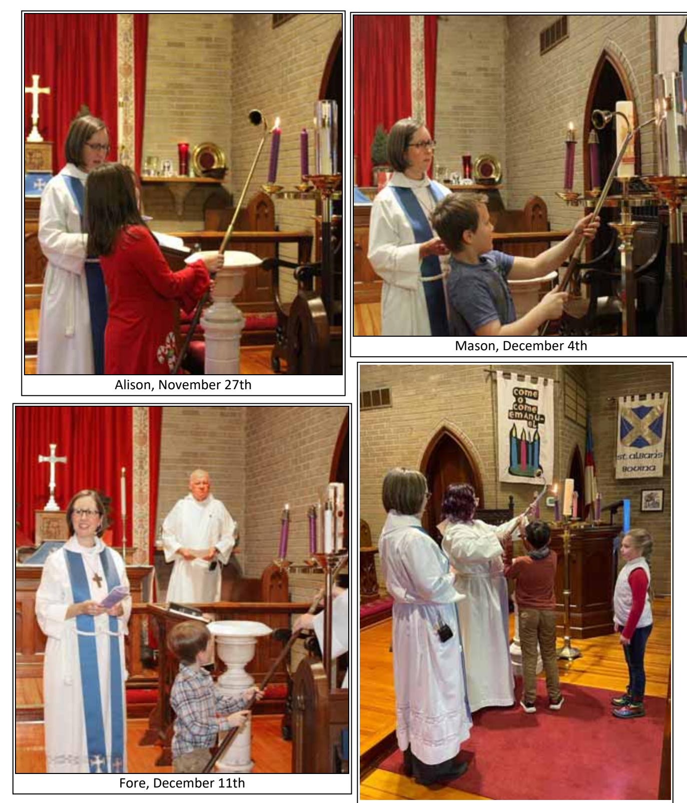
Briggs & Taylor, December 18th